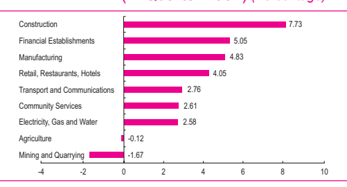
Graph 1 GDP by Sectors, Annual Variation (III Quarter 2004) (Percentage)