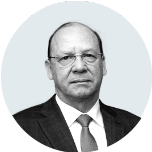
Germán Ávila Minister of Finance and Public Credit

The Governor of the Central Bank is elected by the Board of Directors every four years, renewable for two terms, which means that they might remain in office for up to twelve years. This election is made following a rigorous process that ensures that the person elected meets the same qualities and requirements set for the full-time members of the Board, including the rules for enforcement of disqualifications or incompatibilities.