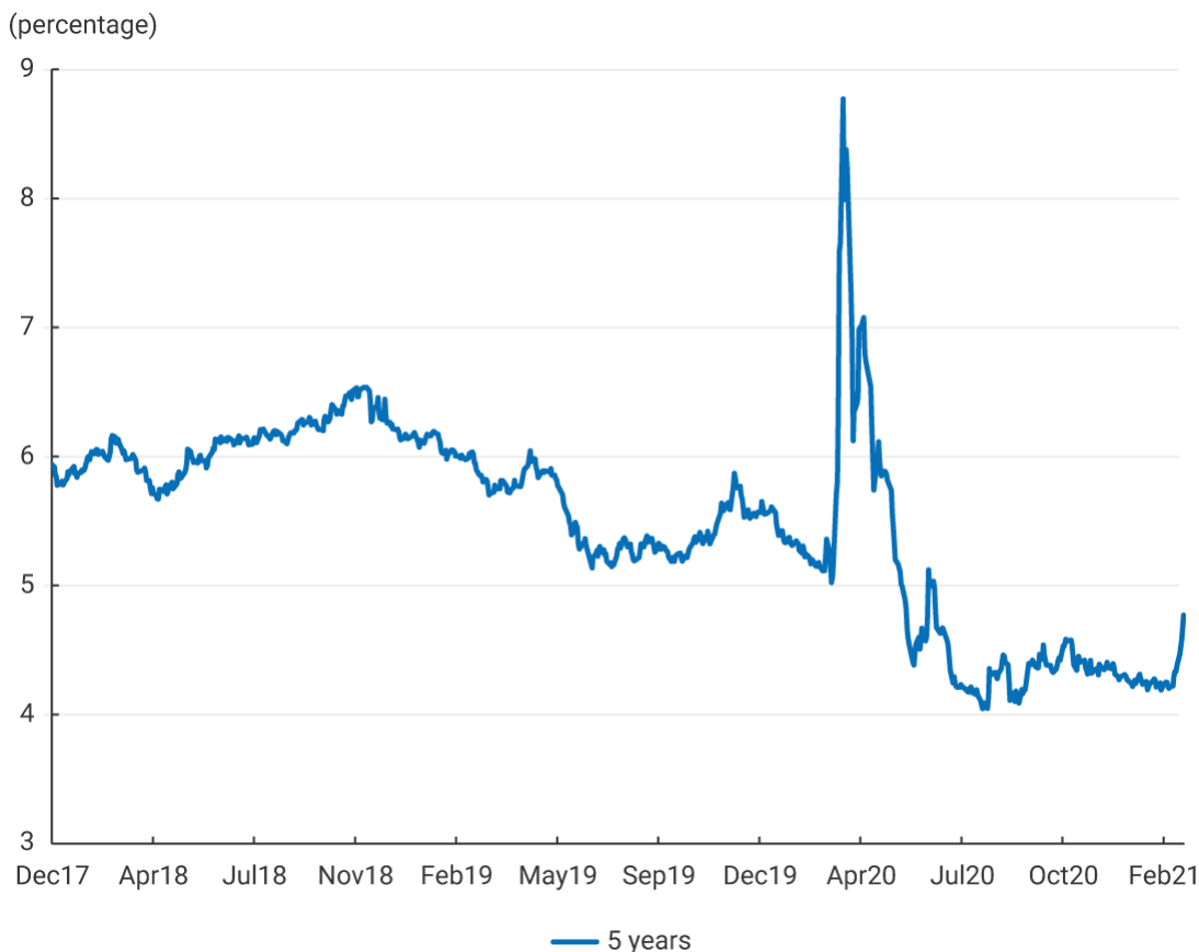
Graph 2. Five-year peso TES zero-coupon rates (change between 29 February and 31 December 2020)