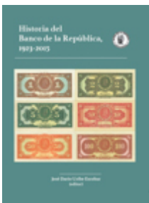
Título: Historia del Banco de la República 1923-2015 ISBN 9789586643665 Year of