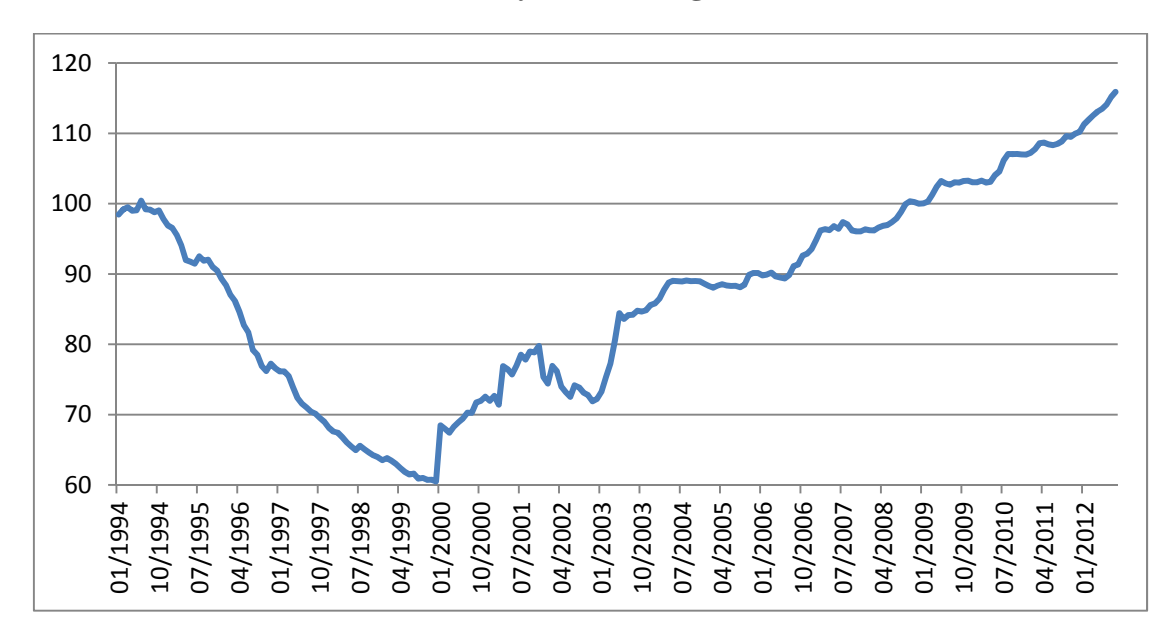
(January 1994 to August 2012)