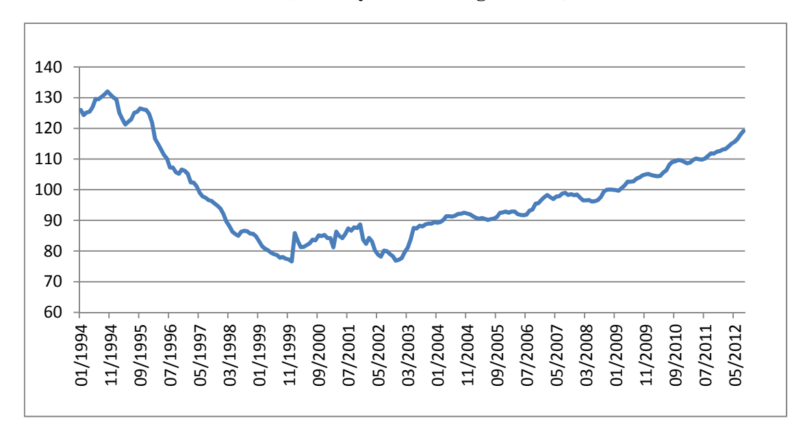
(January 1994 to August 2012)

Figure 2 presents the housing price index deflated by the housing rental price index (Ratio2), which shows a similar behavior as the index in Figure 1.